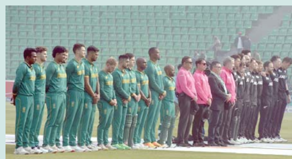
LAHORE: Players of South Africa and New Zealand stand alert for their National Anthem before start of the 2nd match of tri-Nation series between New Zealand and South Africa at Qaddafi Stadium in Provincial Capital.

The tournament saw intense competition, incredible talent, and sportsmanship, reinforcing its stature as a key platform for professional golfers in the country.