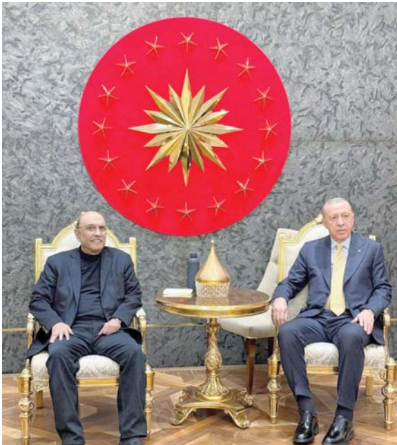
President Asif Ali Zardari meeting with the Turkish President Recep Tayyip Erdoğan, during his brief stopover in Istanbul on February 10, 2025.

During the visit, memorandums of understanding were signed between Pakistan and