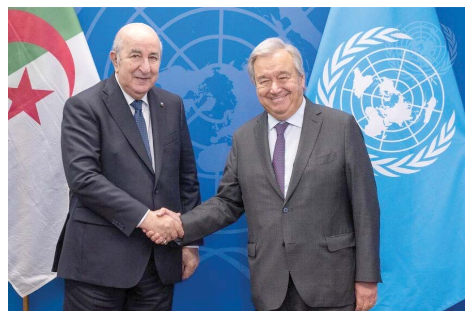
President Mr. Abdelmadjid Tebboune with UN SG Mr. Antonio Guterres

In this context, he pointed out Algeria's full conviction that what Africa is facing is not a local threat, but a global threat that has no borders and will sooner or later create wide-ranging repercussions that go beyond the affected African regions, stressing that this conviction is directly inspired by Algeria's bitter and successful experience in combating this scourge.