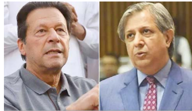
by National Assembly Speaker Ayaz Sadiq.

Barrister Gohar also confirmed that PTI will formally submit its demands in writing during the upcoming PTI-government negotiations chaired