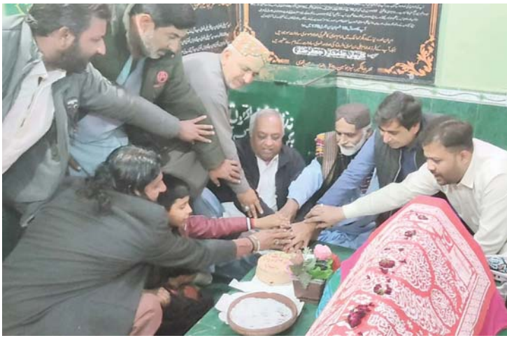
celebrations, gatherings, and rallies Imam Ali (AS) were held in all marking the birth anniversary of Imambargahs, neighborhoods, and