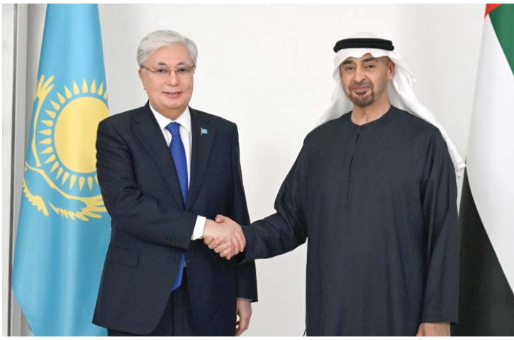
stan. Tokayev noted that direct investment from the UAE more than doubled last year and discussed a new trade turnover goal of $1 billion,

The UAE ranks among the top ten largest foreign investors in Kazakh-