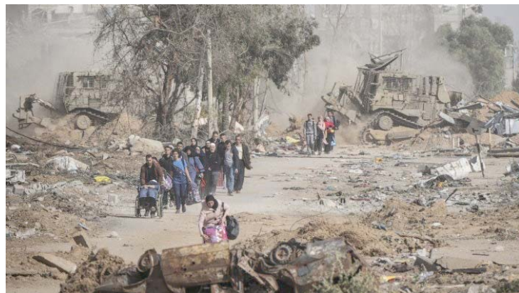
a political tool to remain in power and prolong the coalition at the expense of achieving calm and a political solution to the conflict in a way that guarantees the security and stability of the region. The Ministry warns the interna-

ISLAMABAD: The Ministry of Foreign Affairs and Expatriates condemns the torrent of official Israeli statements and positions that incite to deepen the violation of the occupied West Bank, including East Jerusalem, whether through calls to consolidate the occupation or expand and fatten the settlements and attract more settlers to them, as the Israeli Minister of Housing said. The Ministry believes that Netanyahu is deliberately preserving his coalition through privileges he provides to his partners in the extreme right at the expense of the West Bank, its land, its citizens, their interests and their rights, and using the cycle of violence as