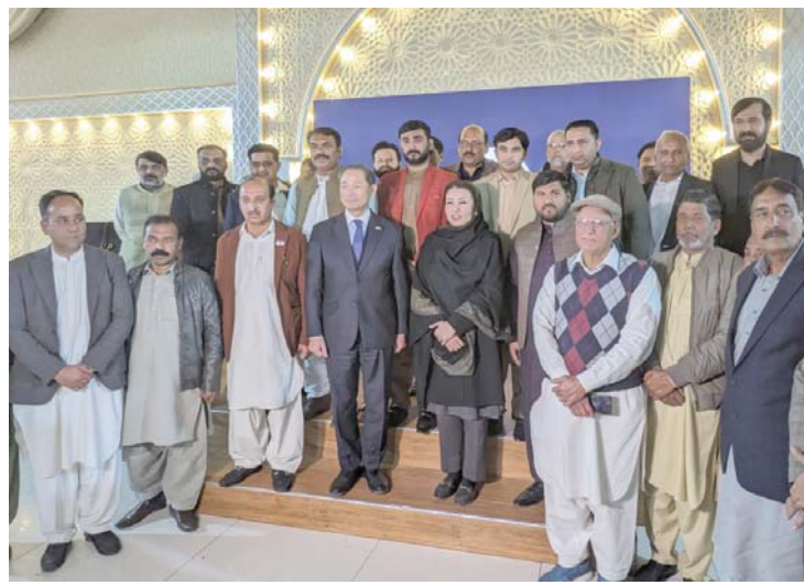
Board Members and community leaders. It is pertinent to mention here that Hana Development Council has received Japanese grant assistance three times to date, implementing projects in collaboration with the