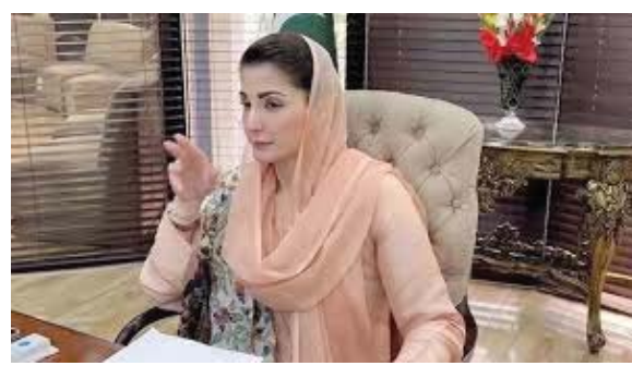
on the housing scheme, CM Maryam Nawaz directed

officials to expedite the loan disbursement process and consider increasing the loan amount to Rs 2 million.