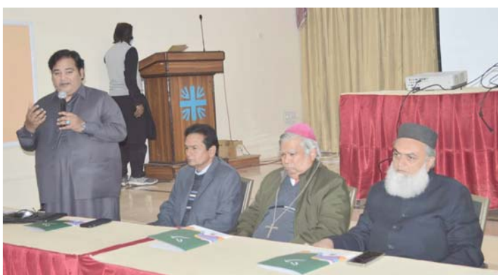
Speaking on the occasion, Executive Secretary Catholic Commission for