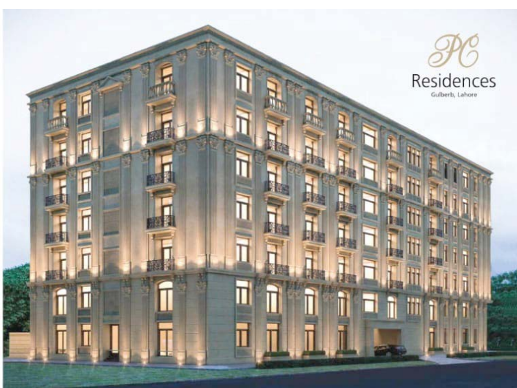
30+ elegantly designed and fully furnished residences in various configurations across seven floors. Each residence features