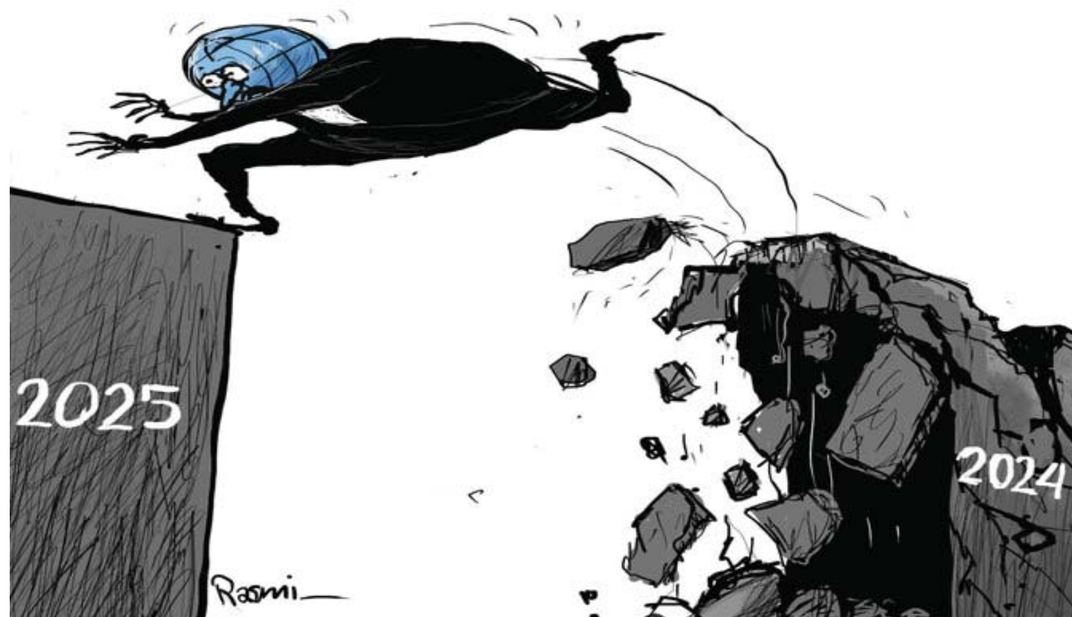
Cartoon by Amjad Rasmi.

To boost consumption, the government will aim to raise residents' incomes, diversify the supply of consumer products and services, identify new consumption growth areas and improve the overall consumption environment, the NDRC said.