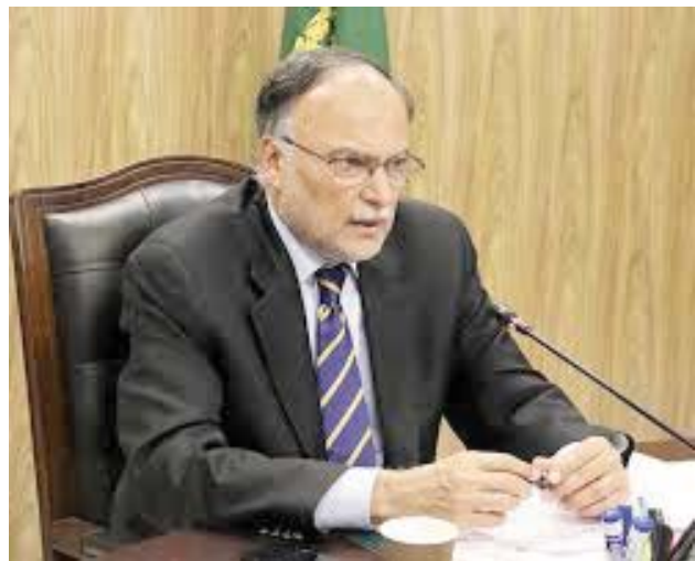
remarks during a media briefing on the recently unveiled 'Uraan

ISLAMABAD: Minister for Planning, Development, and Special Initiatives Professor Ahsan Iqbal on Friday said that each and every project would be evaluated in line with the standards and targets, set under the 'Uraan Pakistan' programme to achieve sustainable economic growth before it became part of the Annual Development Plan (ADP). "Uraan Pakistan is not fiction or merely a book, but a reality, and its implementation has already begun. In the next development budget, only the projects that comply with the set growth targets will be included," he said. The minister made these