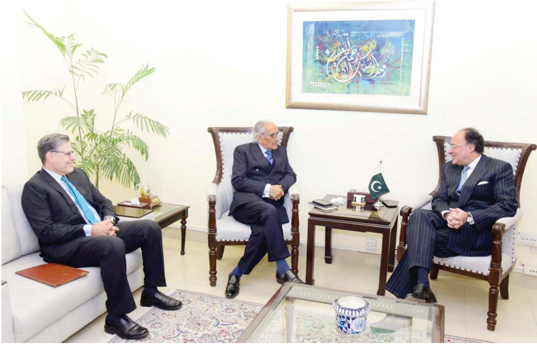
The meeting ended with expression of commitment to further deepening the strategic and economic ties between Pakistan and China, recognizing the immense potential for mutual benefit in the years to come.