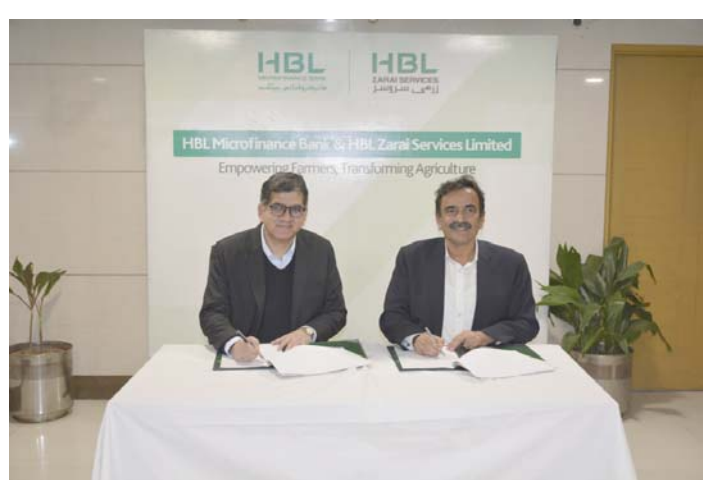
addresses the comprehensive needs of farmers, helping them achieve greater productivity, and sell efficiently and to grow sustainably."