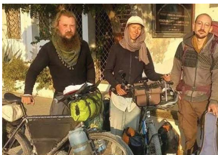
the district police department, around 40 suspects have been arrested so far in an effort to recover the stolen items. An FIR has been registered at the Sujawal

Police Station under sections 397 and 34 of the Pakistan Penal Code.