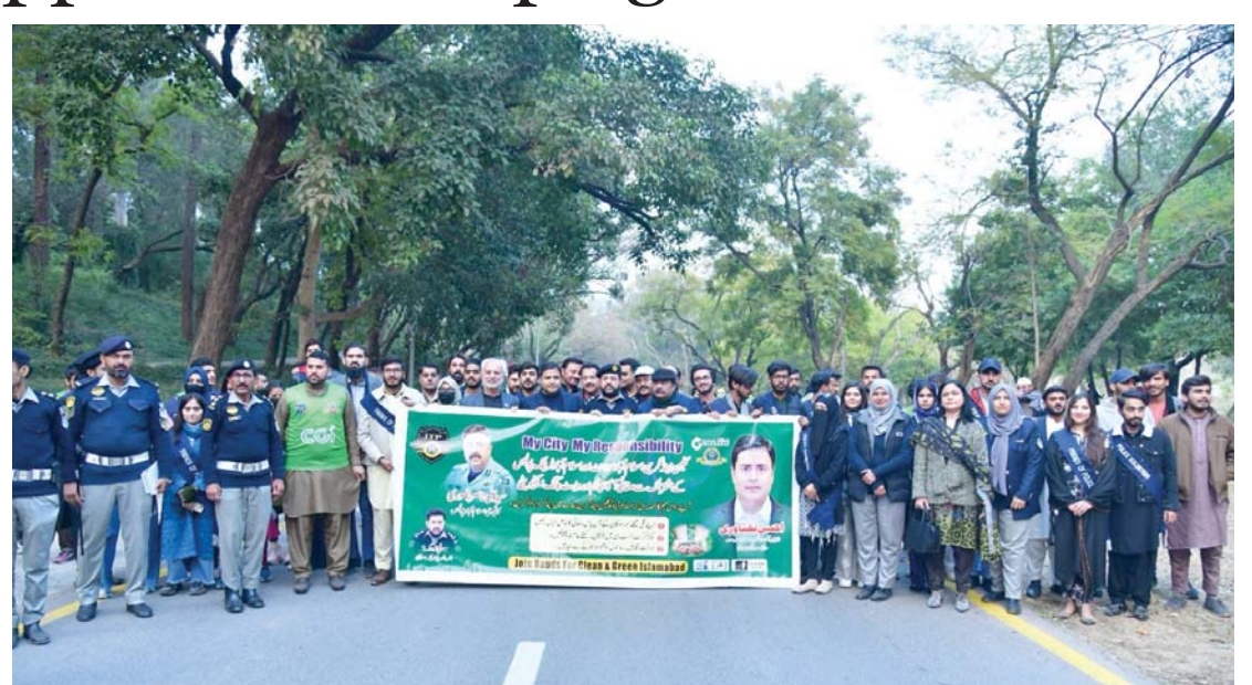
The event concluded with participants pledging to fulfill their responsibilities in maintaining cleanliness and protecting the environment. The Clean and Green Islamabad Movement's initiative aims to not only raise awareness about the importance of cleanliness but also bring about a positive change through practical actions.

cleanliness and protecting the environment. He urged citizens to avoid openly throwing garbage on streets and in parks. The event aimed to highlight the importance of cleanliness among citizens and raise awareness about reducing environmental pollution. The walk commenced at Kashmir House, where participants carried banners and placards displaying messages on cleanliness and environmental conservation. Awareness pamphlets were distributed among citizens during the walk to Ayub Chowk. At the end of the walk, a waste-picking activity was held, where participants cleaned up litter from roadsides and parks. Students actively participated in the event, pledging to take responsibility for protecting the environment for future generations. A student remarked, "We must provide a clean and green future for our generations, and this is only possible when we make cleanliness a part of our daily lives."