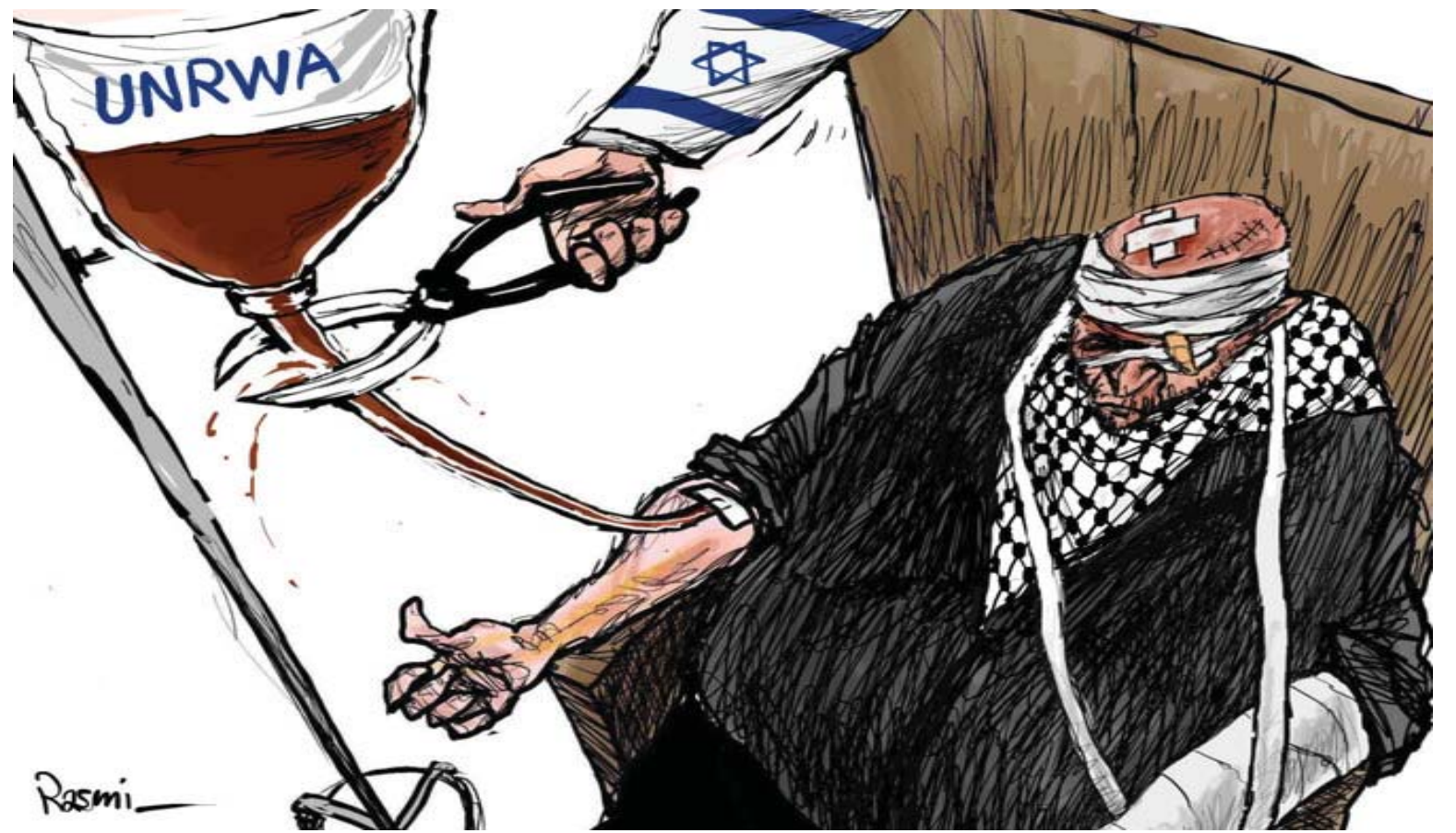
Cartoon

Writer is Press Secretary to the President (Rtd), Former Press Minister at Embassy of Pakistan to France and Former MD, SRBC. He is living in Macomb, Detroit, Michigan