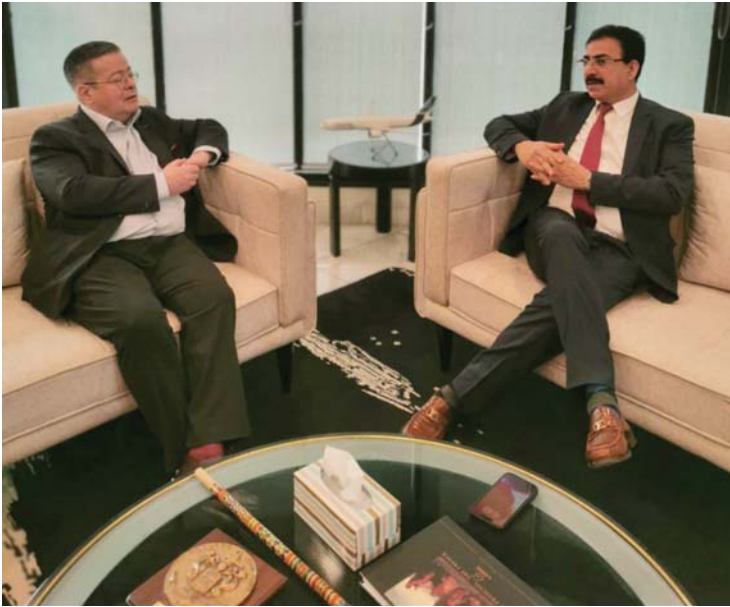
the meetings held between French President Emmanuel Macron and