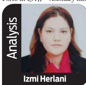
Analysis Izmi Herlani

Quaid-e-Azam's influence on Pakistan is both profound and enduring. He not only forged the nation from struggle but also instilled values of democracy, equality and justice that resonate today. As the guiding light for future generations, his ideals serve as a moral compass, inspiring the people of Pakistan to honour his legacy and strive for a brighter, more prosperous future. His vision for Pakistan Air Force as a formidable and unparalleled fighting force underscores his understanding of the crucial role Air Power plays in modern warfare and national defence. His foresight in establishing a strong, independent Air Force not only aimed to safeguard Pakistan's sovereignty but also to instill a sense of pride and resilience in its people. By emphasising professionalism, innovation and a commitment to excellence, Quaid-e-Azam laid the foundation for an Air Force that continues to evolve and adapt, ensuring that it remains SECOND TO NONE in all aspects.