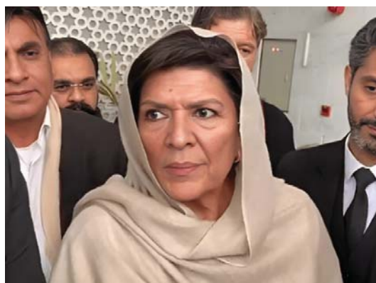
not given access to meet the PTT's founder in Adiala Jail. He said the party's founder formed the negotiation team so as no one could say that the team was not formed for talks.

The Leader of Opposition in the National Assembly Omar Ayub said that the PTT's negotiations' team was