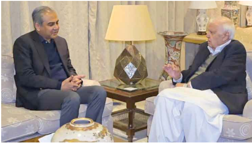
to do politics on the sensitive issue of Kurram," the interior minister said.

Earlier, the provincial apex committee had decided to eliminate all the bunkers in Kurram district to ensure peace in the volatile region.