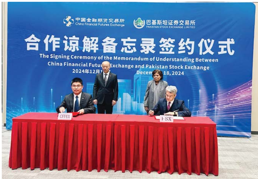
Chinese capital markets, explore opportunities for cross-border investment products, and enhance market access and investor participation for both Pakistani and Chinese entities.

The primary goal of the visit was to deepen collaboration between the Pakistani and