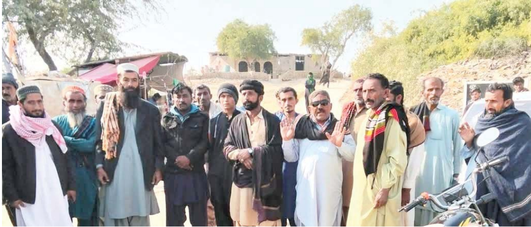
Gulab Laghari to the shrine in Agham Kot with provocative slogans. They even threatened and forced pilgrims to leave without visiting the shrine.

It should be noted that this is the same group that has been persistently working for the past 6-7 years to provoke a significant religious conflict in the area. These individuals have harassed pilgrims visiting Bibi's shrine from across the country, humiliated them, and created obstacles for their visits. In the past, they tore pages of the Holy Quran and scattered them in the cemetery, threw the wooden pulpit of the mosque outside, invited members of a banned religious organization to enforce strikes in Gulab Laghari, staged sit-ins, and organized rallies from