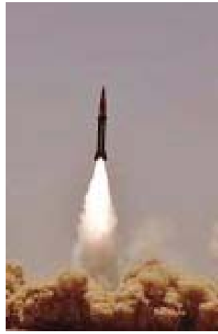
ar-armed states with missiles that can reach the U. S. home-

land "is very small and they tend to be adversarial," he continued, naming Russia, North Korea and China.