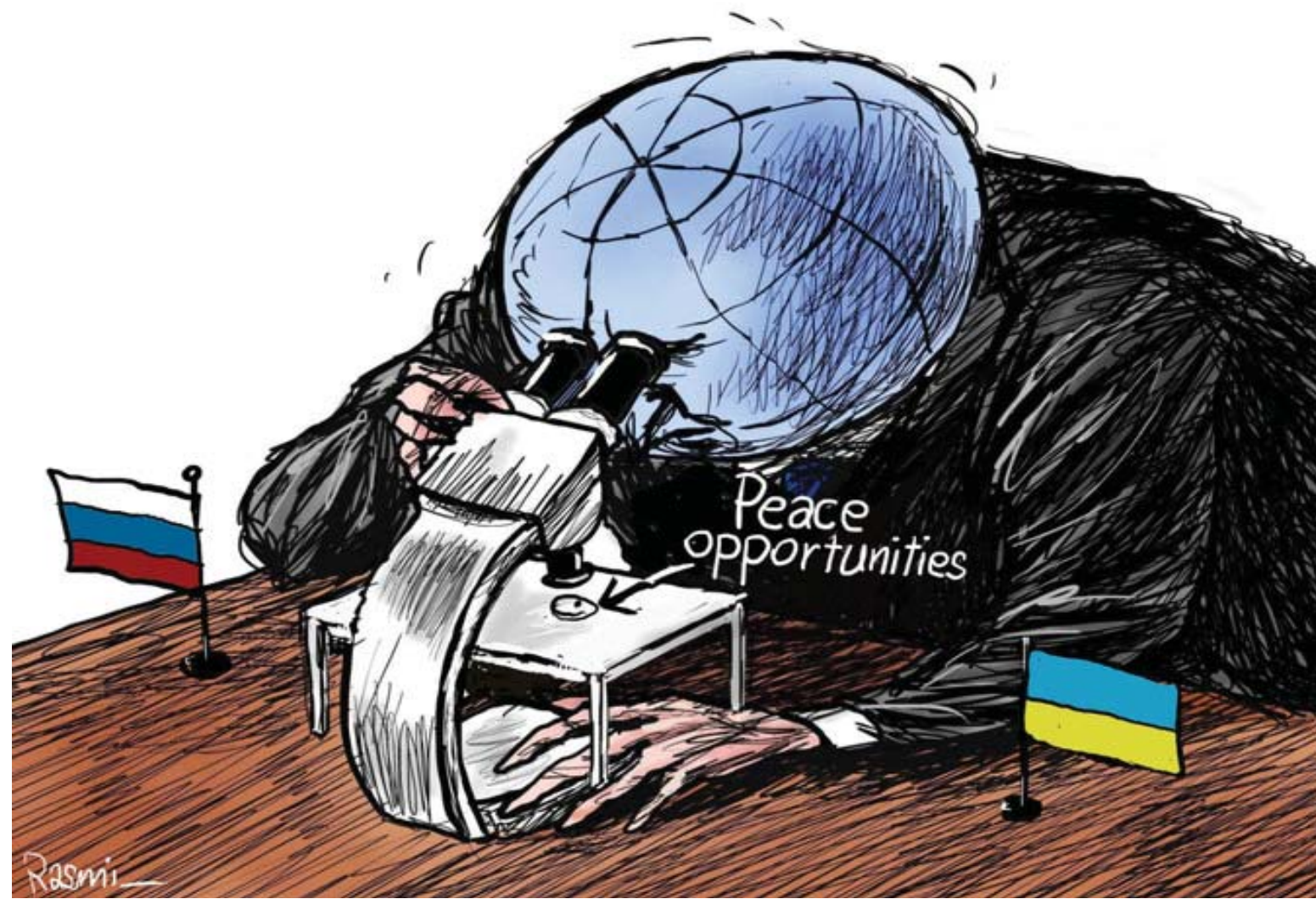
Cartoon by Amjad Rasmi. (Courtesy of Ashraf Al-Azcat)