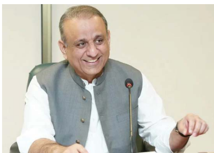
Federal Minister for Communications Abdul Aleem Khan directed that

Federal Minister added that the helicopter service and provision of emergency ambulances on the patron of 1192 in all four provinces so that the injured ones can be provided relief without wasting any time.