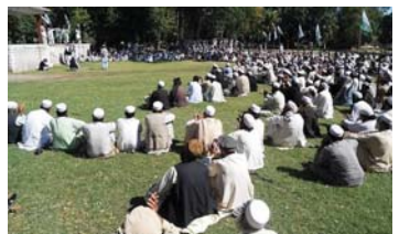
rally, carrying placards and banners calling for an end to Ali Wazir's "illegal imprisonment".

SOUTH WAZIRISTAN: A large protest rally was organized by Wazir tribesmen and PTM workers in Rustam Bazar, Wana, Lower South Waziristan district of Khyber Pakhtunkhwa, demanding the immediate release of former MNA Ali Wazir. Thousands of people, including tribal elders, political leaders, Ullamas, and PTM workers, participated in the