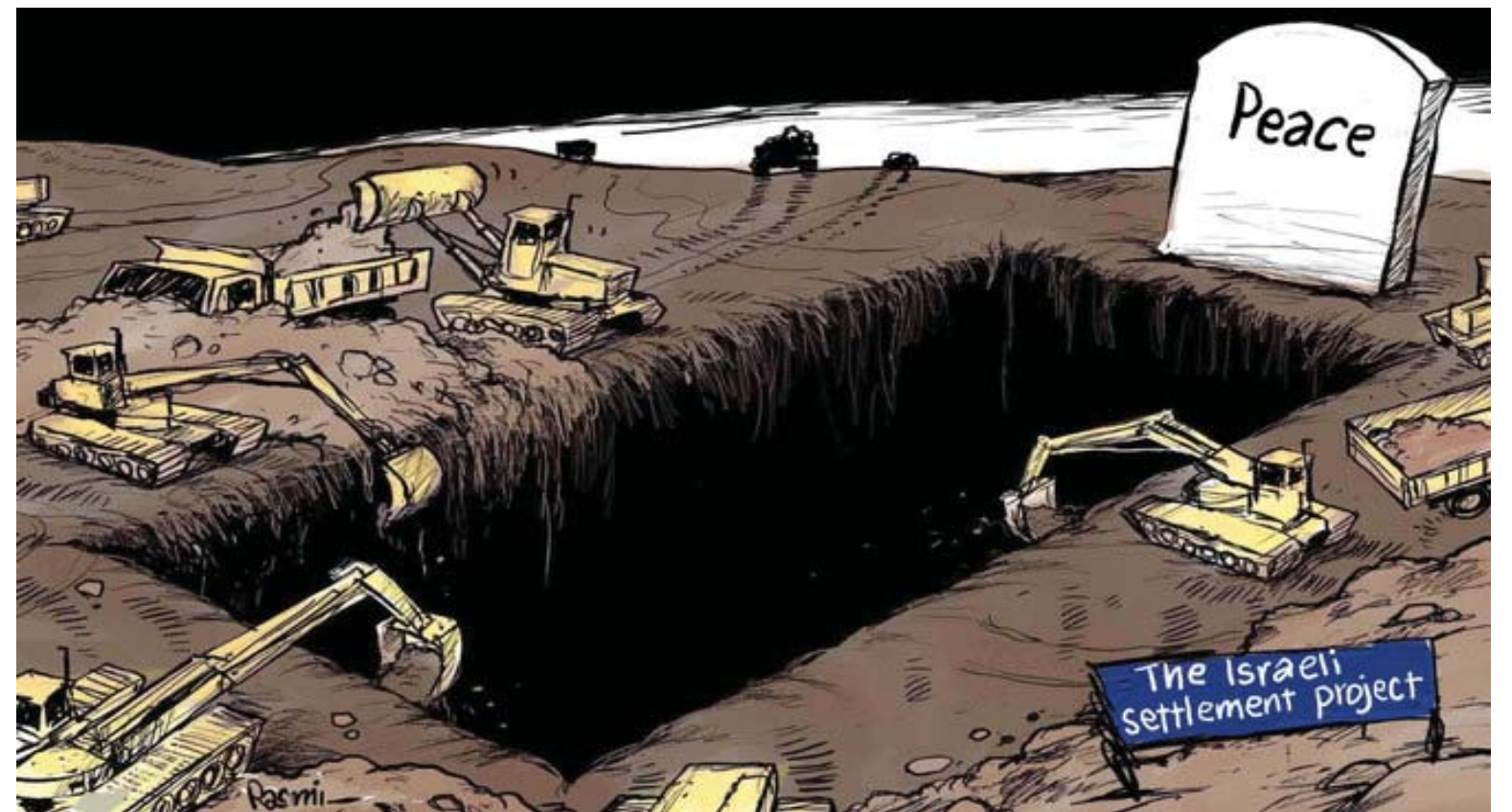
Cartoon by Amjad Rasmī.

The financial sector attracted $249 million in FDI this year, up from $247 million the previous year, followed by the gas sector, which received $125 million during the same period, with an increase of 27pc.