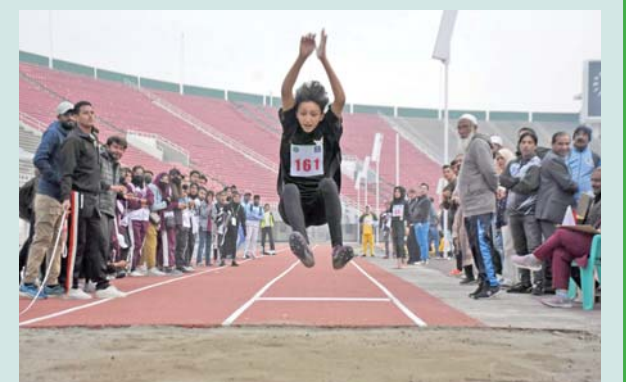
ISLAMABAD: An athlete's competes in the women long Jump during Quaid-e-Azam Inter-Provincial Games 2024 at Jinnah Stadium, Pakistan Sports Complex, in the Federal Capital.