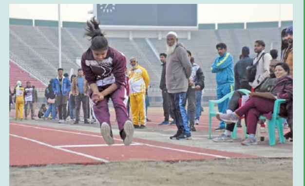
ISLAMABAD: An athlete's competes in the women long Jump during Quaid-e-Azam Inter-Provincial Games 2024 at Jinnah Stadium, Pakistan Sports Complex, in the Federal Capital.