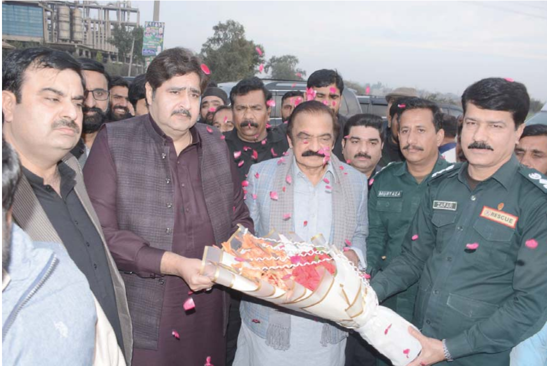
bypass road, emergency services will be available immediately.

In view of this need, Secretary Emergency Services Dr. Rizwan Naseer made special efforts to establish Aminpur Bangla Station and its construction work was completed in a short time. With the activation of Aminpur Bangla Station, it will not only be possible to provide rescue services in the villages near Narawal Road but also on the