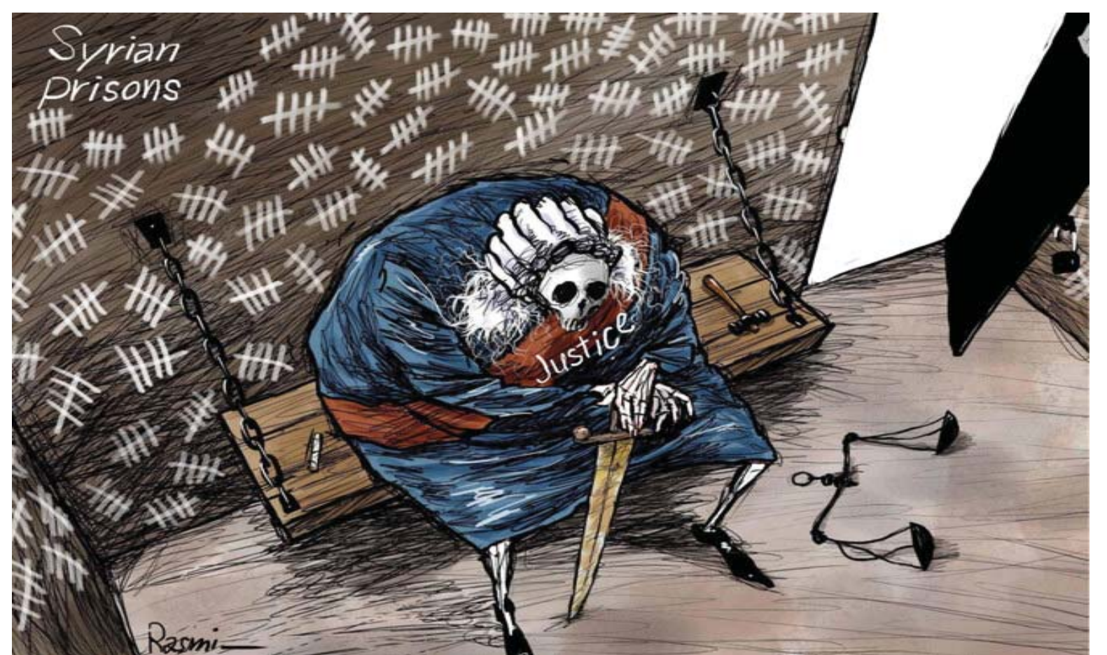
Cartoon by Amjad Rasmi.

Reiterating their commitment to the Pakistan-EU Strategic Engagement Plan (SEP) signed in 2019, Pakistan and the EU reviewed the state of its implementation, five years on. Pakistan presented proposals to expand bilateral cooperation in additional areas, among others in agriculture, taxation, and disaster risk reduction.