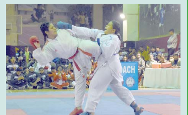
ISLAMABAD: Players are in action in judo karate match during Quaid-e-Azam Inter-Provincial Games 2024 at Jinnah Stadium, Pakistan Sports Complex, in the Federal Capital.