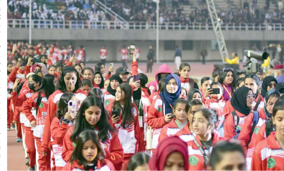
ISLAMABAD: Players of Sindh march past during opening ceremony of Quaid-e-Azam Inter Provincial Games.

"Instead of teaching our youth to excel in sports, some forces governance to ensure that federa-