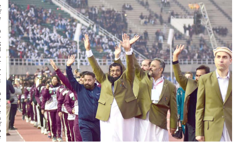
ISLAMABAD: Players of Khyber Pakhtunkhwa march past during opening ceremony of Quaid-e-Azam Inter Provincial Games.

tried to lure them into destructive activities," he said, emphasizing the government's commitment to bringing the youth back to sports fields.