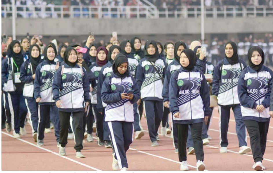
ISLAMABAD: Players of Balochistan march past during opening ceremony of Quaid-e-Azam Inter Provincial Games

The PSB, the event organizer, has brought together 2,000 male and female athletes to compete in 15 disciplines, including athletics,