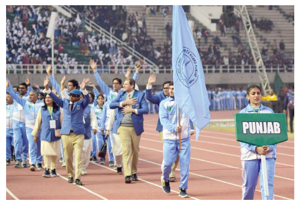
ISLAMABAD: Players of Punjab march past during opening ceremony of Quaid-e-Azam Inter Provincial Games.