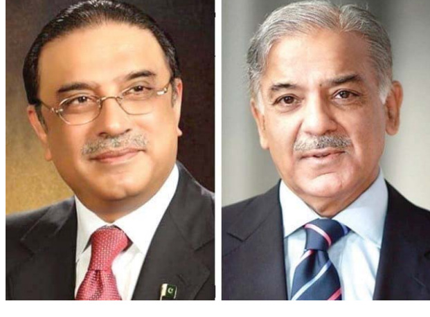
are ongoing regarding the new bill on madrassah registration.

Sources further informed that consultations between the government and Jamiat Ulema-e-Islam-Fazl (JUI-F)