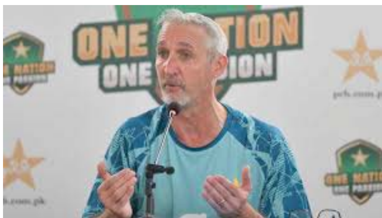
LAHORE: Pakistan Test head coach Jason Gillespie speaks during a press conference at the Rawalpindi Cricket Stadium on Oct 23, 2024.