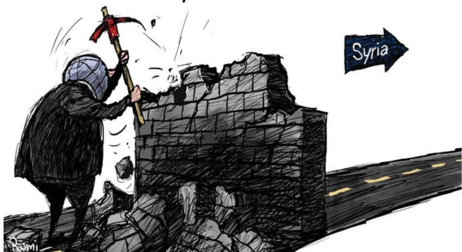
Cartoon by Amjad Rasmi.

The UN and partners continue to support humanitarian response across the country and are resuming activities as security conditions allow.