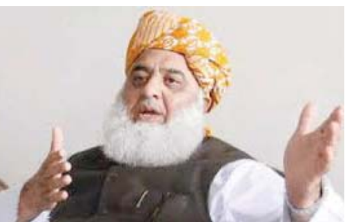
😂 🛛 Bureau Report

Govt declared war against religious seminaries,