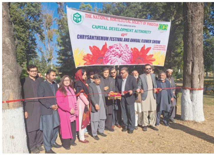
flower exhibition every year. Nature has always been the focus of human