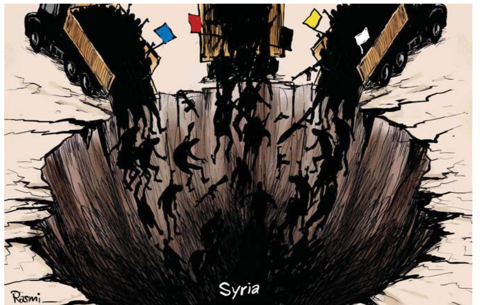
Cartoon by Amjad Rasmī. (Courtesy of Ashraf Al-Awsat)