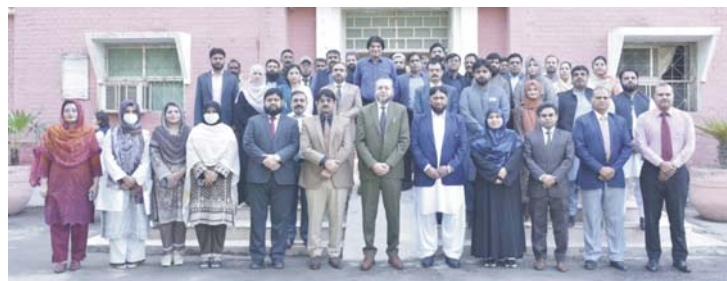
of Pharmacy, gave a detailed briefing to the Vice Chancellor about the academic