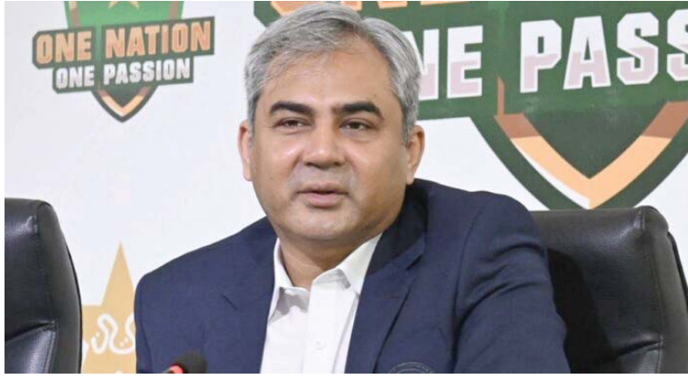
During his visit, the Chairman PCB inspected various ongoing activities, including the newly constructed upper-

The main building's grey structure has achieved 100 per cent completion, while the pavilion building stands at 90 per cent completion. Work on enclosures is 75 per cent complete, with structural development for seating and trench work entering its final stages.