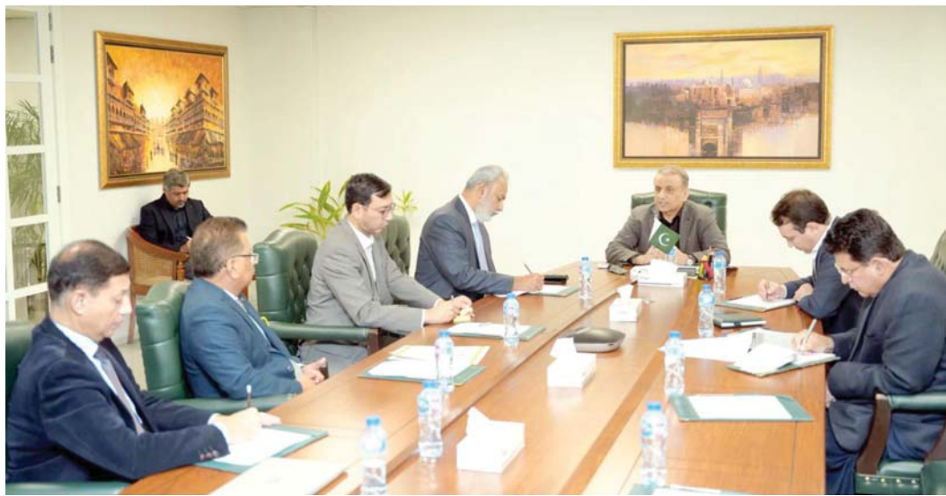
Communications Abdul Aleem Khan on the performance of the organization and informed him about the progress made so far in the light of his instructions, especially in generation of revenue.

In the meeting, Chairman National Highway Authority and other senior officers gave a detailed briefing to Federal Minister for