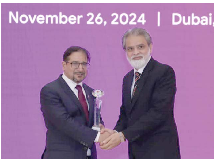
His recognition stands as a testament to his unwavering efforts and profound impact on the Islamic financial landscape.