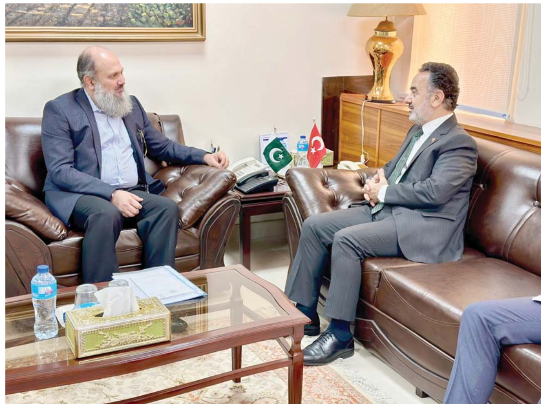
Ambassador Neziroglu and Minister Khan agreed on the importance of government-to-government (G2G) and business-to-business (B2B) engagements.

The minister also mentioned the Joint Task Force on Textiles, initiated after discussions during the COMCEC Ministerial Meeting in 2023, as a mechanism to rationalize tariffs and strengthen the textile value chain.