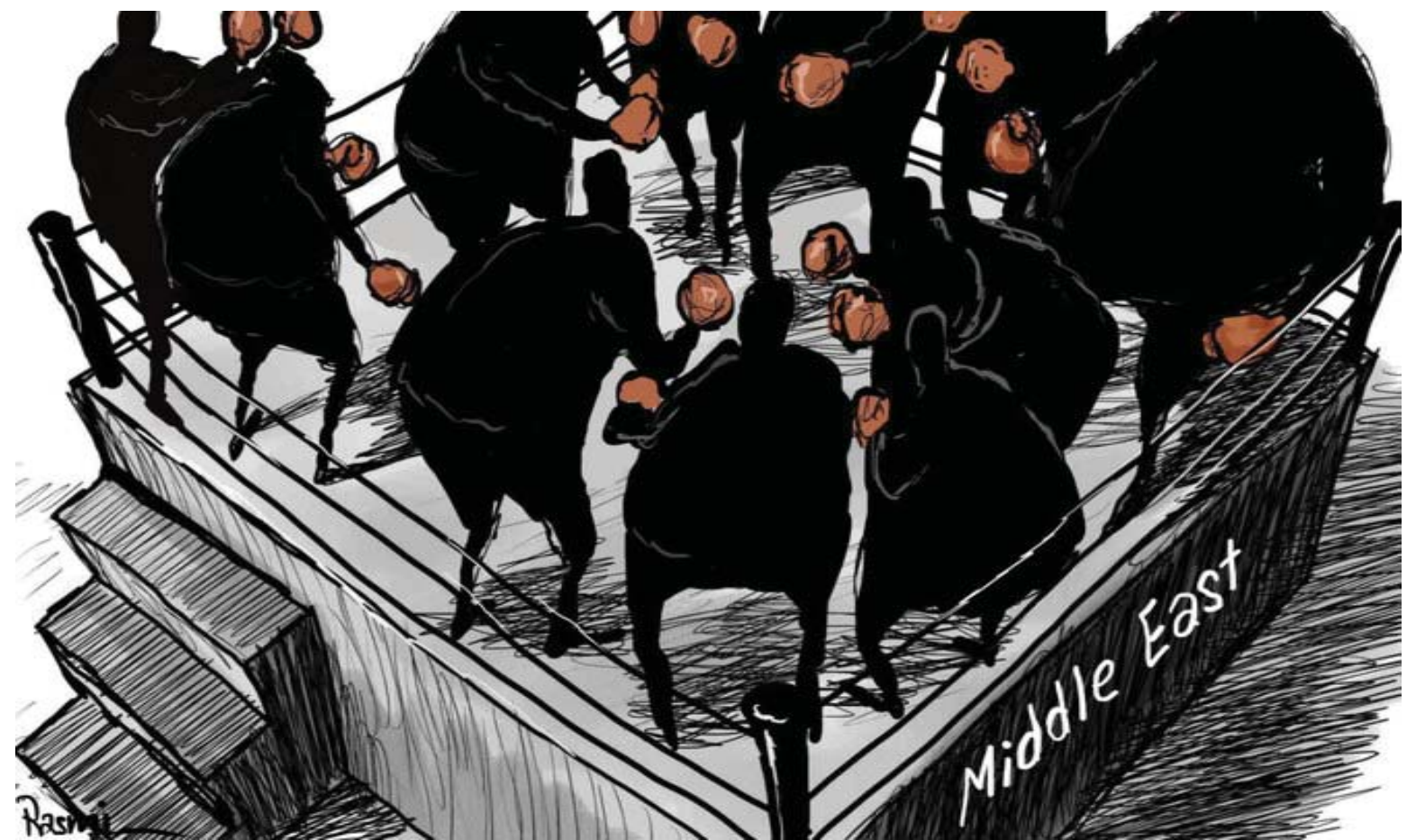
Cartoon by Amjad Rasmi.

A number of foreign airlines also grounded Pakistani-origin pilots over concerns about their licences.