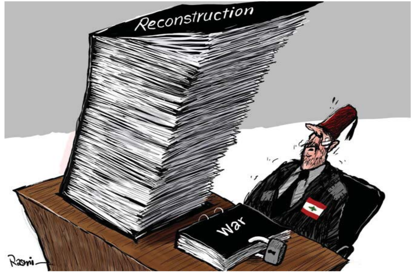
Cartoon by Amjad Rasmī.

The planning minister further reiterated that the outcomes of these reviews would guide future allocations and policy adjustments, ensuring that development projects contribute meaningfully to Pakistan's economic and social growth.