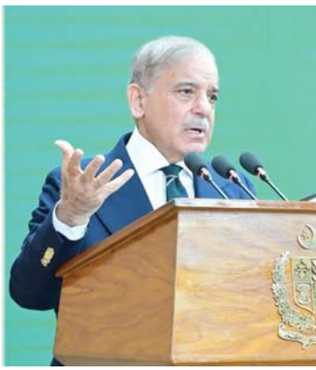
He said the brave soldiers of Pakistan Army, Law Enforcement Agencies (LEAs), civilians, doctors,

nurses, skilled workers, children, mothers and people from all walks of life rendered sacrifices to defeat terrorism.