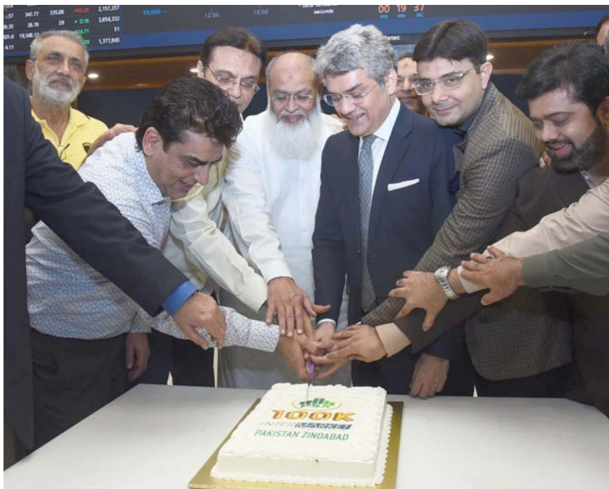
of 20.9% in PKR terms and 7.7% in USD, underscoring its resilience and appeal.

Over the past five years, Pakistan Stock Exchange has delivered an annual return