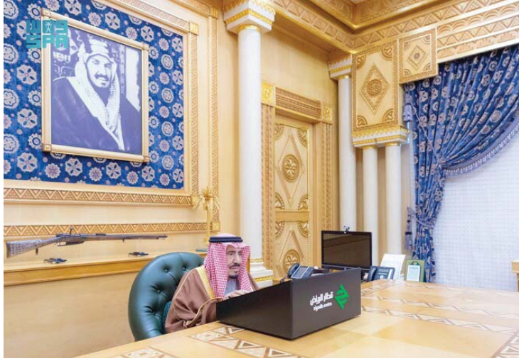
Chairman of the High Commission for the Development of Riyadh, Crown Prince Mohammed bin Salman said.

"The Public Transport Project in Riyadh City, with its train and bus components, is the fruit of King Salman's efforts and is based on his insightful vision when he was