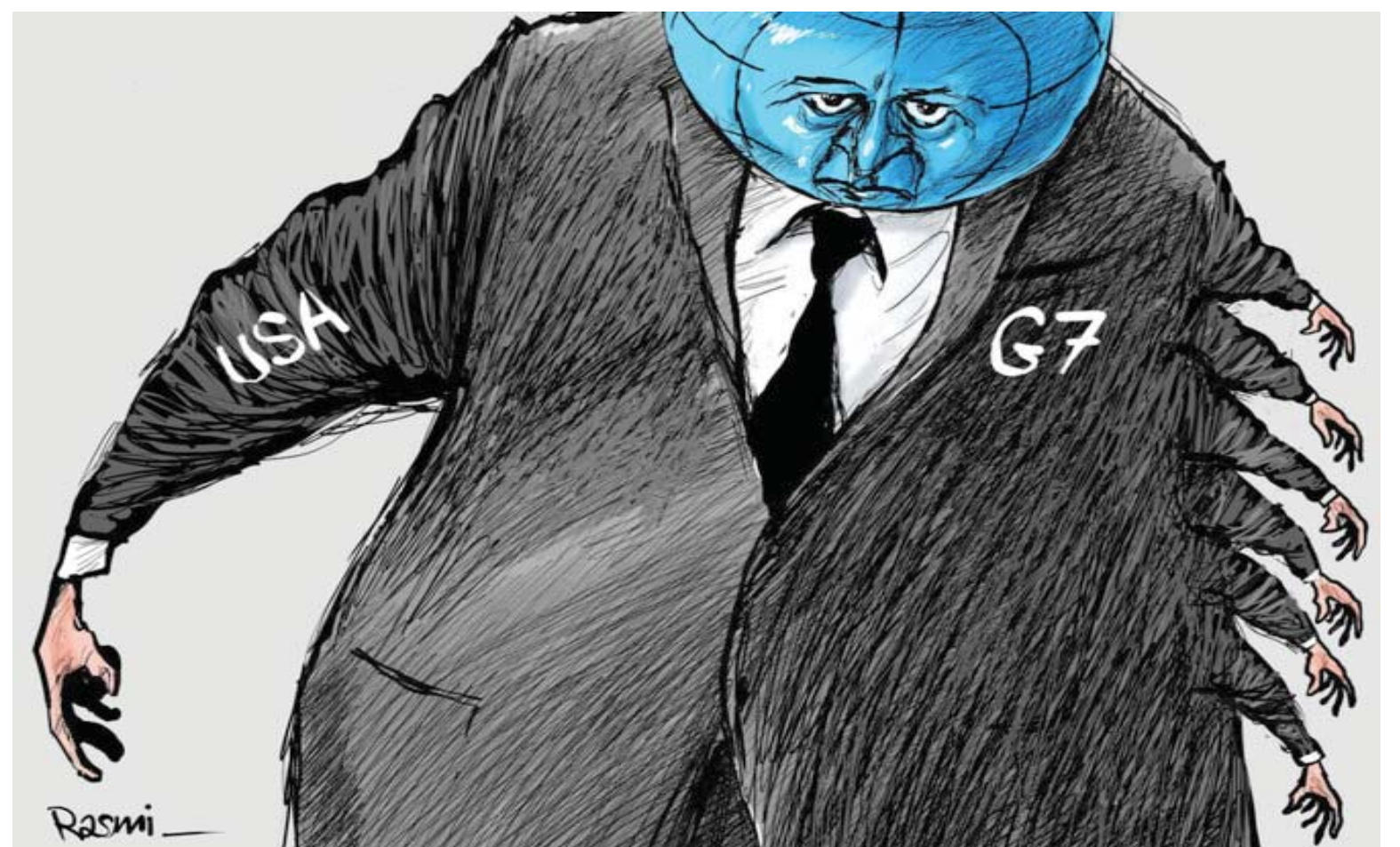
Cartoon

Cooperation in science and technology. Collaboration between the Auditor General's Office of Pakistan and Belarus' State Control Committee.