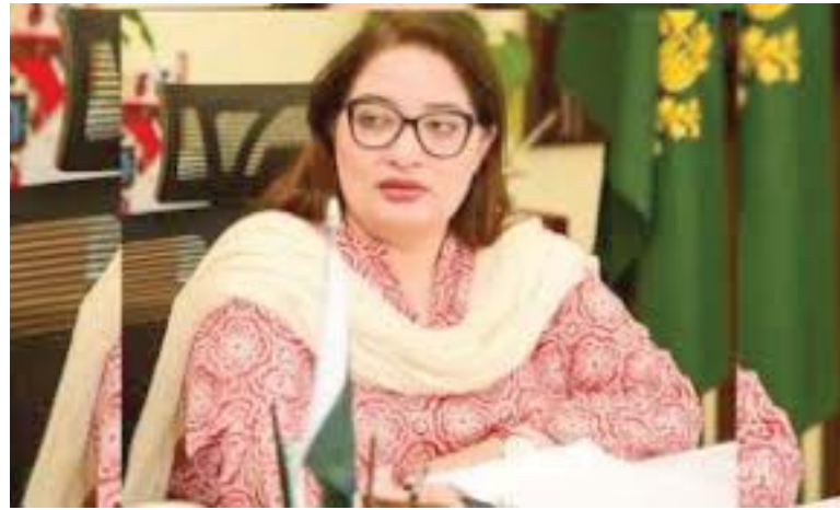
ment, especially Paris Agreement's global temperature target of 1.5 degree Celsius", she added.

"Pakistan stresses that the principles of equity and common but differentiated responsibilities and respective capabilities form the very basis of global climate change. We also reaffirm that COP remains the most essential and critical forum for forging global consensus toward the achievement of the goals of UNFCCC and Paris Agree-