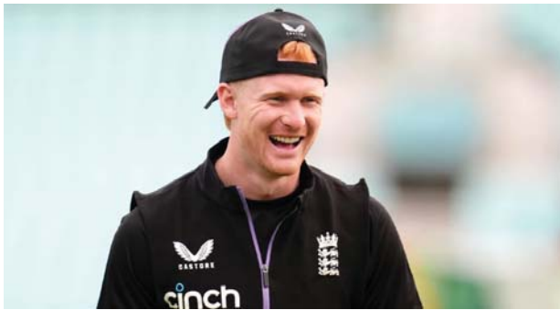
In Cox's absence, Surrey's Ollie Pope stepped in as wicketkeeper for the final day of the warm-up fixture. "I'm gutted for Jordan (Cox)," Test head coach Brendon McCullum said. "He has been shaping up nicely, both with the

KARACHI: England Men's batter-wicketkeeper, Jordan Cox, has been ruled out from the upcoming Test series against New Zealand after sustaining a fractured right thumb during a net session in Queenstown. The Essex player, poised to make his Test debut in Christchurch next week as a stand-in for Jamie Smith (on paternity leave), suffered the injury ahead of play on day two of the two-day tour match against the New Zealand Prime Minister's XI at Sir John Davies Oval.