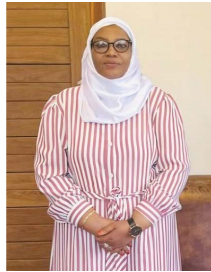
It plans to achieve this through the implementation of the second National Strategies

She said that Rwanda aspires to become a Middle-Income Country by 2035 and a High-Income Country by 2050.