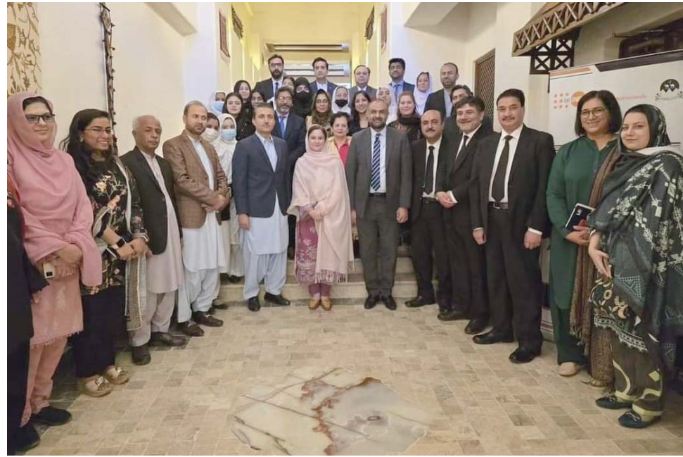
that the implementation of laws is lacking, we must also recognise the need to strengthen the very foundation of these laws. I strongly support the establishment of ARCCs in Balochistan and remain committed to ensuring their effective creation and operation."