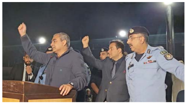
ahead of the Belarus delegation's visit on November 24, followed by

He stressed the importance of heightened security measures