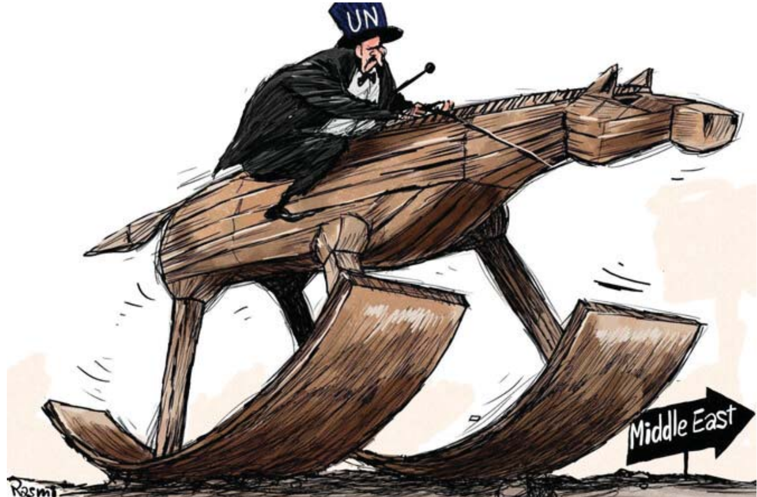
Cartoon by Amjad Rasmī.

Afghanistan remains the top country of origin for the region's displaced, where over nine million forcibly displaced are located. Neighbouring nations Iran and Pakistan bear the brunt, sheltering 3.9 million and 2.4 million Afghan refugees respectively.