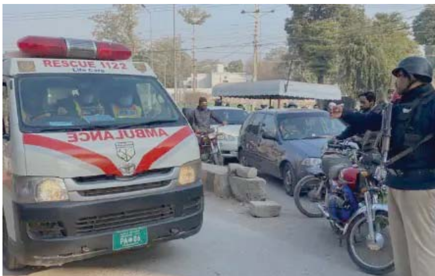
involved in both incidents, firing indiscriminately from both sides of the road."