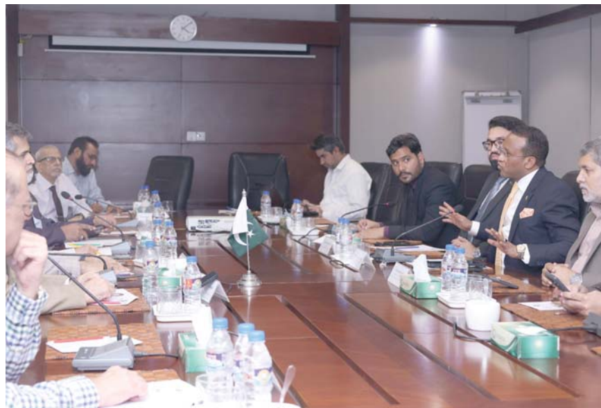
Ababa is a third diplomatic hub hosting a number of international conferences every year including the African Union Summit. "This shows the strategic importance of Ethiopia and safe and secure environment for the global citizens." The Ambassador expressed gratitude to the Government of Pakistan for hosting the Single Country Exhibition in Addis Ababa in May 2025, which would eventually give