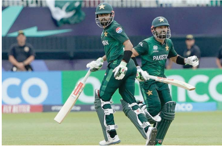
Babar and Rizwan, no Pakistani batter is among the top 50 batters in the T20I rankings, with Fakhar Zaman (64) being

the third-highest-ranked batter from the country. Meanwhile, Indian batter Tilak Varma