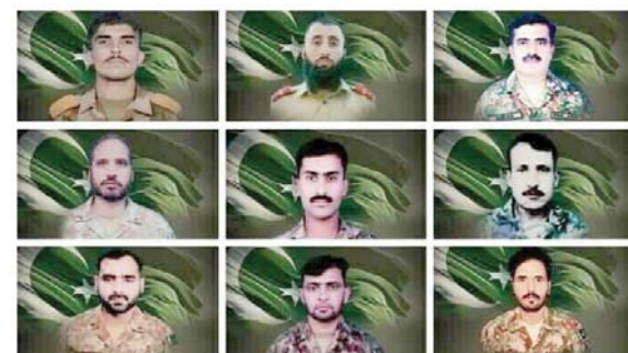
Rawalpindi: Nine of the 12 soldiers who were martyred in Bannu on November 19.