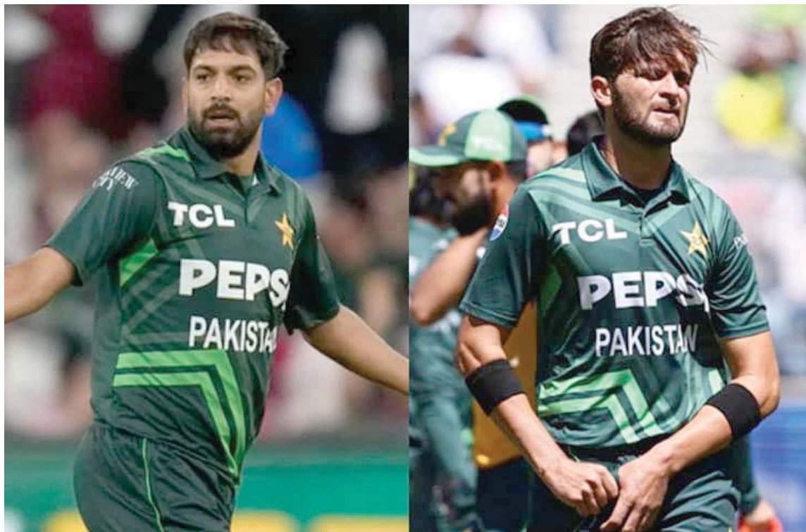
with 601 rating points after taking five wickets in three games at an average of 15.40.

Meanwhile, Abbas Afridi claimed six wickets in as many games at a brilliant average of 6.66, which resulted in him