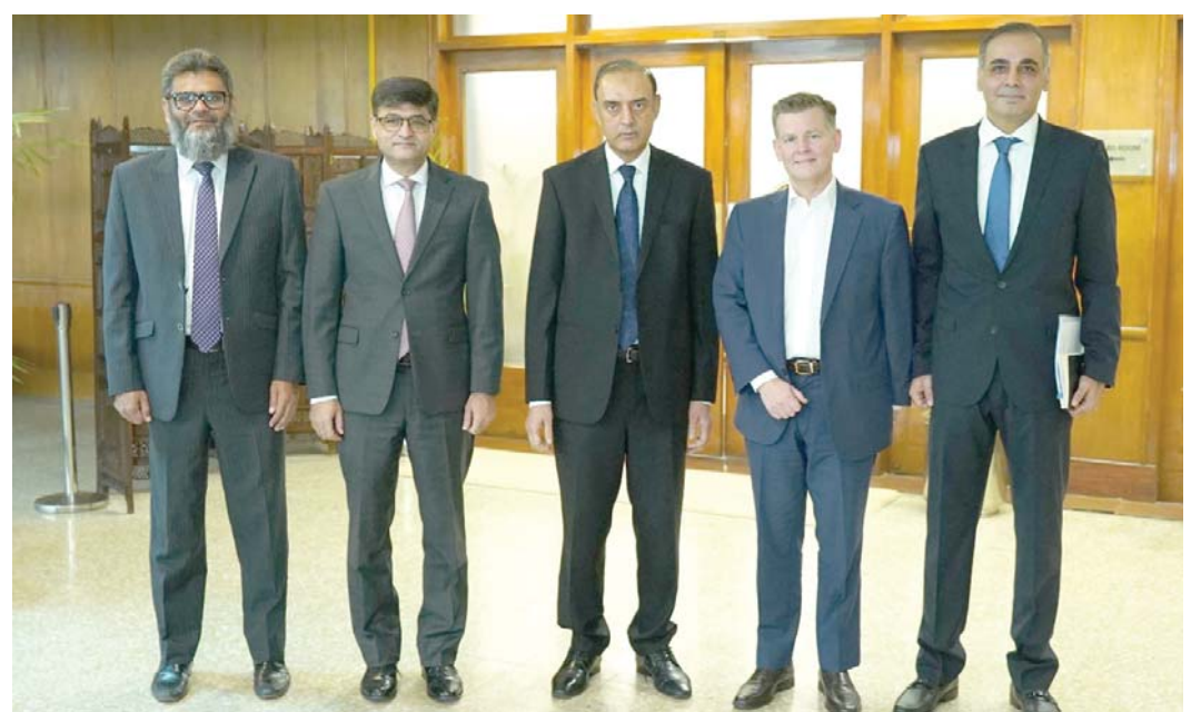
tors of TMB, in its meeting held on October 25, 2024, approved the financial results for Q3 2024.