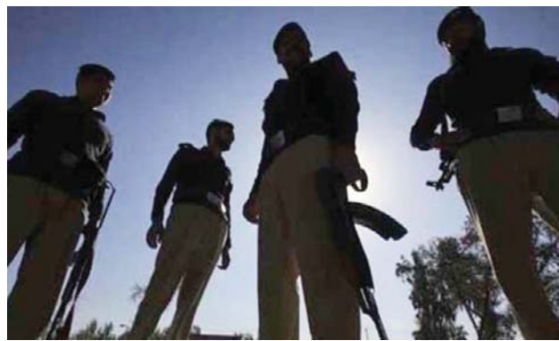
The policemen were taken from a police station in the Ahmadzai subdivision. The attack occurred in broad