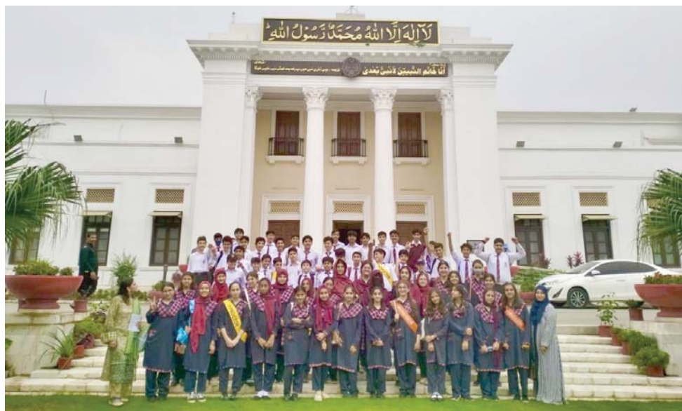
The study tour proved highly beneficial for the students, offering them a unique opportunity to witness the workings of the provincial government firsthand.