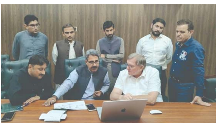
fast-tracked. And the launch of solar-ization schemes in other places will

In order to reduce the cost of electricity bills, work on solar projects is