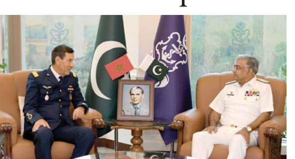
跨 City Desk