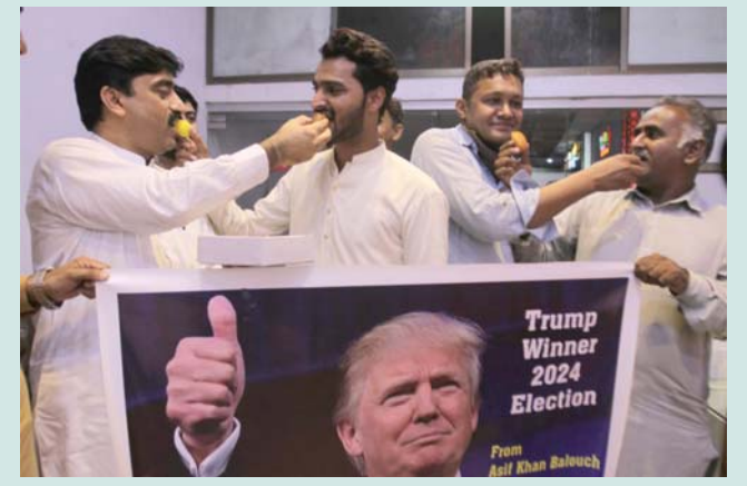
MULTAN: Peoples Celebrating the President Donald Trump winning on Friday.

He also encouraged students to share their experiences and feedback to help enhance the