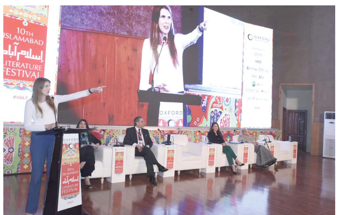
mount. Zehra Nigah, known for her poetry highlighting social issues, appreciated the equitable stance of the OUP, by always ensuring perfect exposure to Urdu literature