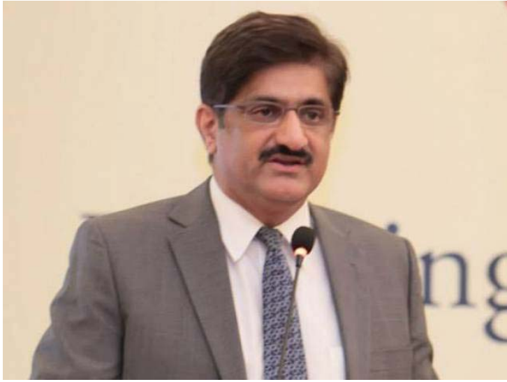
to be released to [downstream Kotri] sea has been an invincible job," he said