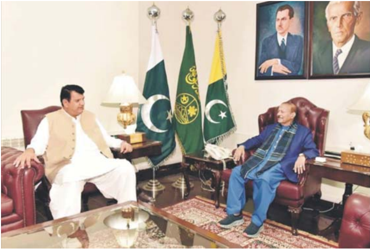
day out. About the recently concluded elections, President Chudhary

ISLAMABAD/MUZAFFARABAD: Federal Minister for Kashmir Affairs and Gilgit-Baltistan Engineer Amir Muqam called on President Azad Kashmir Barrister Sultan Mahmood Chaudhry here today. During their one on one meeting, the duo discussed in detail the issues of mutual interest with special focus on ongoing political and human rights situation in the Indian occupied territory of Jammu and Kashmir. On this occasion, Barrister Chaudhry, while apprising the federal minister about the fast deteriorating political and human rights situation in the held territory, said that Indian occupation forces have unleashed reign of terror in the region by killing innocent civilians day in and