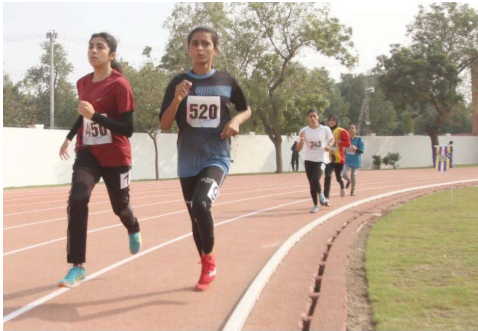
A large audience, including people from various walks of life, citizens, and students, enthusiastically attended the ongoing championship events and cheered for the athletes.