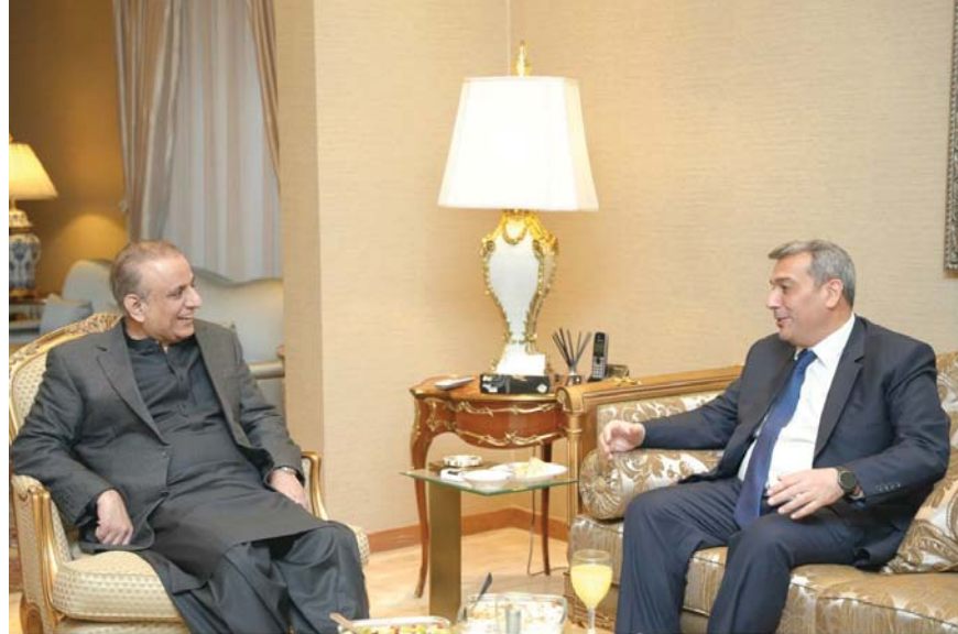
positive progress is being made from both sides. Federal Minister Abdul Aleem Khan