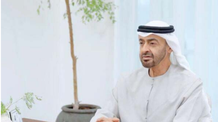
Below is the statement of the President in full:

The President also expressed deep gratitude to the heroes' families, reaffirming the UAE's unwavering commitment to supporting them. He emphasised that their loved ones' sacrifices will forever epitomise selfless dedication to the progress and prosperity of the UAE.