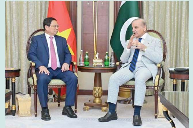
Prime Minister Muhammad Shehbaz Sharif meets Prime Minister Pham Minh Chinh of Vietnam on the sidelines of the 8th Future Investment Initiative (FII) Conference in Riyadh on Wednesday.