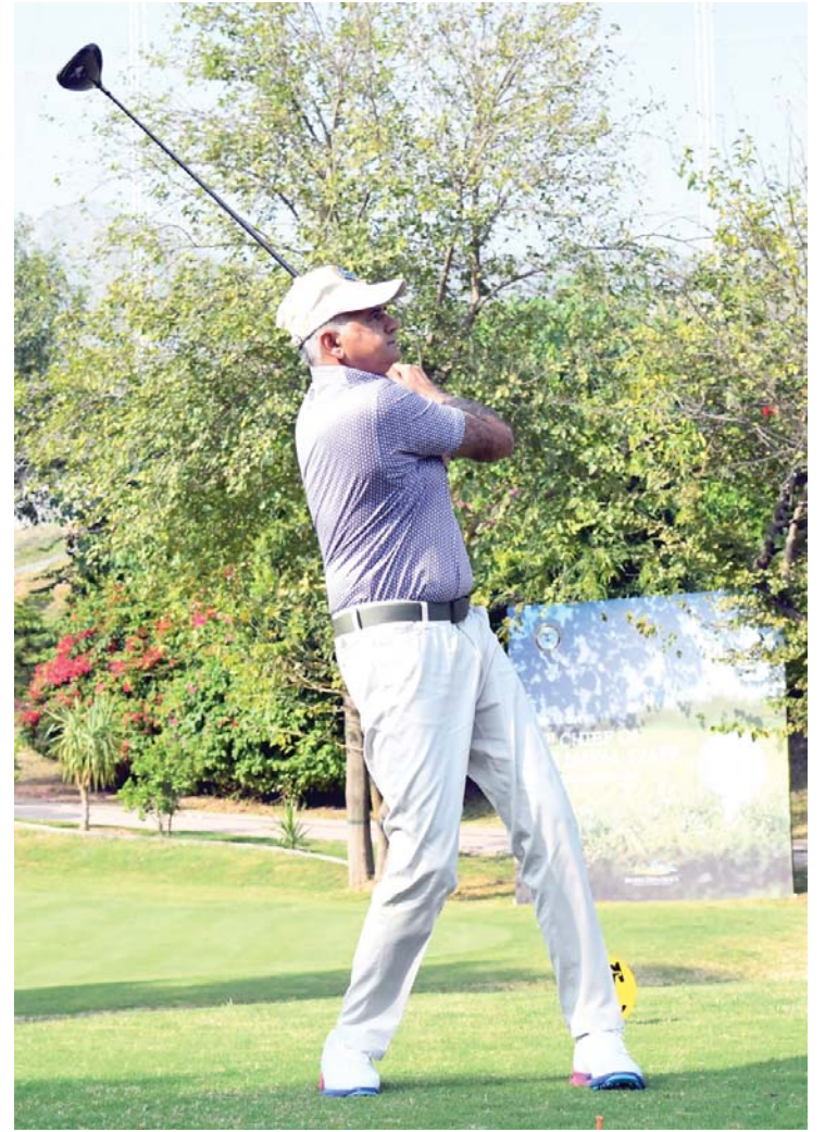
the Pakistan Navy's commitment to promoting golf at both national and international levels. The Opening Ceremony was attended by golfers, sponsors, and media representatives.