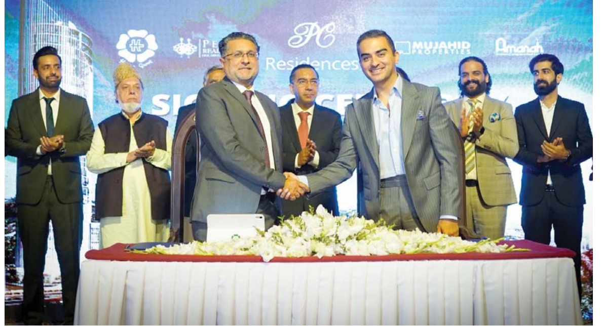
owns and operates the Pearl-Continental Hotels & Resorts, PC Legacy, and Hotel Amanah in Pakistan and maintains interests in the information technology, fintech, water, investment, travel and tourism, and real estate sectors.

Hashoo Group is Pakistan's premier conglomerate, boasting a diversified business portfolio that spans national and international markets. The Group