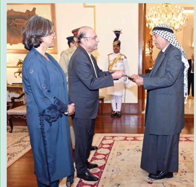
The Ambassador-designate of the State of Palestine, Dr Zuhair Mohammad Hamdallah Zaid, presented his diplomatic credentials to President Asif Ali Zardari, at Aiwan-e-Sadr, on Monday.

Conclusion and Future Initiatives The roundtable underscored the importance of addressing Pakistan's complex security landscape through comprehensive, multi-faceted approaches. Each speaker highlighted specific challenges while advocating for robust policy measures, strong governance, and proactive engagement with communities. The IICR remains dedicated to fostering dialogue, strategic insights, and collaborative efforts to address the nation's evolving security dynamics.