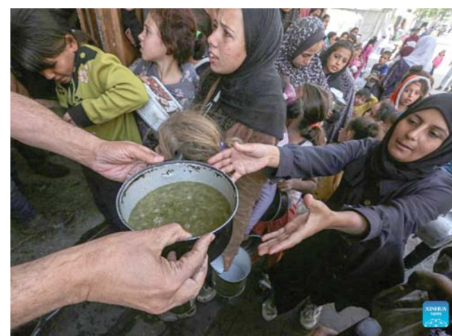
A Palestinian woman receives food at a food distribution center in the city of Deir al-Balah in central Gaza Strip.

Agriculture Organization of the United Nations said on social media platform X that, compared to last year, potatoes in southern Gaza can cost up to 5.7 times more, while in northern Gaza up to 66.7 times more.