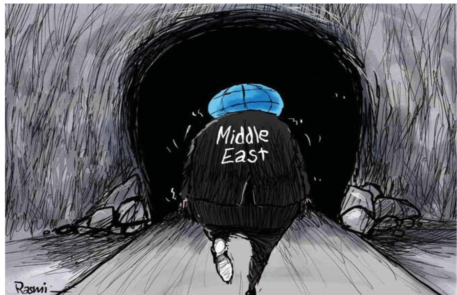
Cartoon by Amjad Rasmi. (Courtesy of Asharq Al-Awsat)