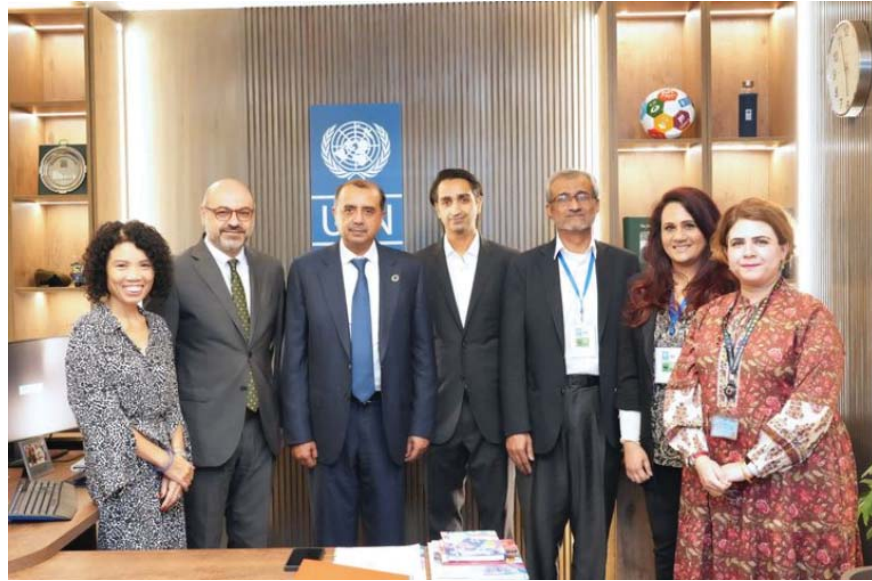
fossil fuel consumption through manufacturing excellence (SDG 7). Additionally, the company is harnessing digital power for rural women and communities (SDG 9), enabling farmers

The comprehensive video showcased Fatima Fertilizer's dedication to eight key areas that fulfill the UN SDGs. Fatima Fertilizer is leveraging renewable solar energy and reducing