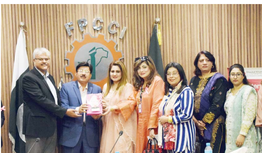
change in an instant. A healthy body nurtures a healthy mind, leading to a brighter future.

This session stressed the critical need for health awareness and precautions, reminding everyone that life can