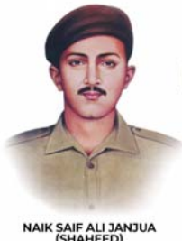
NAIK SAIF ALI JANJUA (SHAHEED) Nishan-e-Haider 26 October, 1948 (Mendhar Sector, IIOJK)