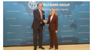
Partnership Framework (CPF).