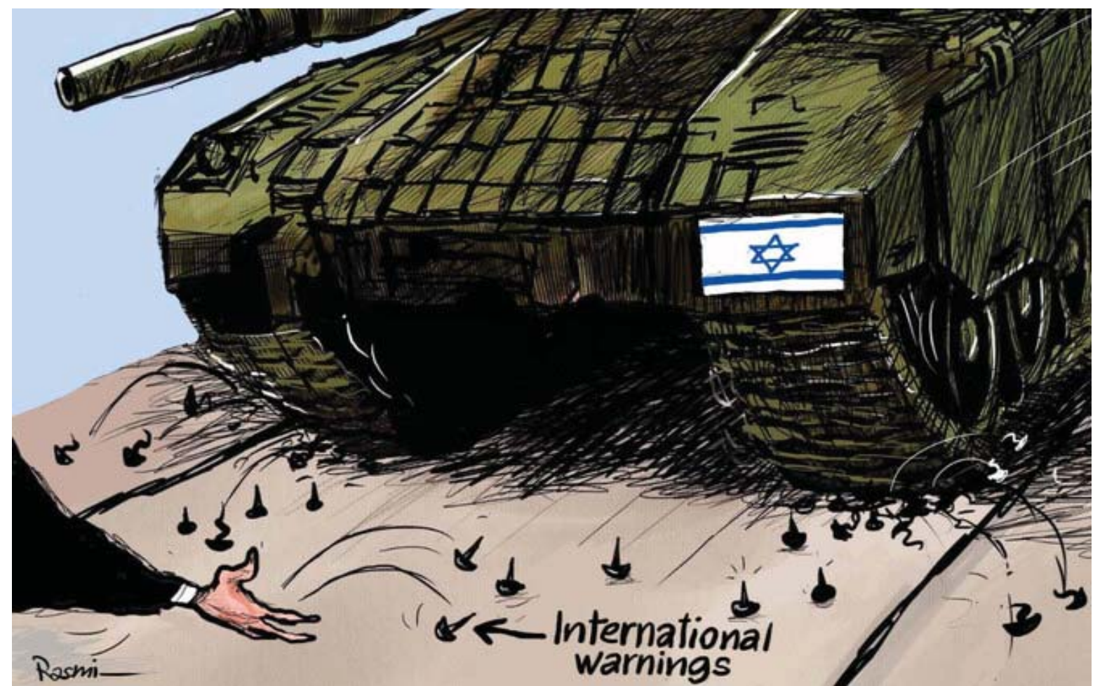
Cartoon by Amjad Rasmī.

Manpower is a vital component of military strength. In terms of active personnel, Israel maintains about 170,000 soldiers in its defense forces, with a reserve force that can quickly be mobilized, bringing the total potential military manpower to about 465,000. The Israeli military is highly trained, with mandatory military service ensuring a constant supply of well-prepared soldiers. However, Iran's available manpower significantly surpasses Israel's. It has an estimated 587,000 active personnel across its regular army, IRGC and paramilitary forces.