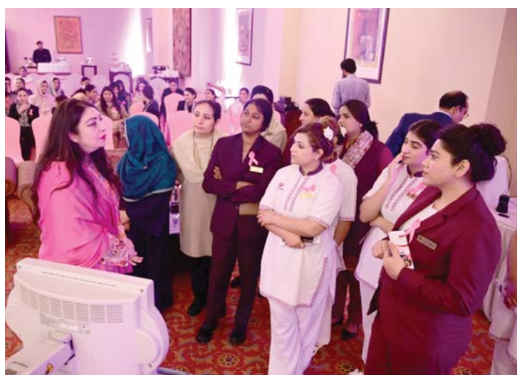
detection and treatment, emphasizing the life-saving importance of

Both the doctors highlighted the importance of early detection and shared details about the state-of-the-art facilities available for mammography, ultrasound, and biopsies. They have also shared important insights into breast cancer