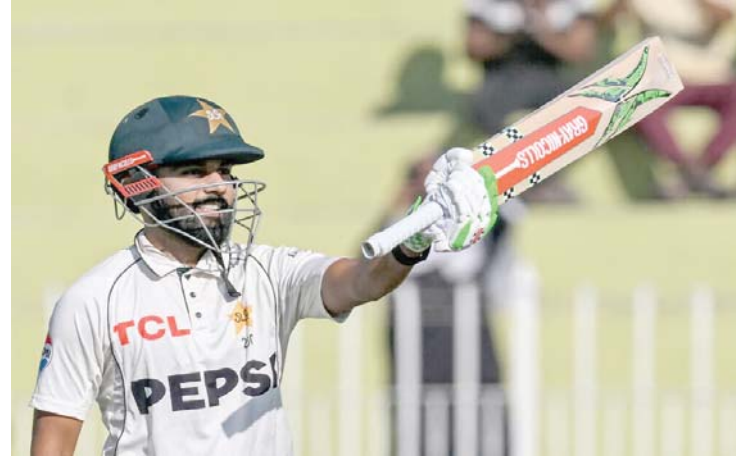
RAWALPINDI: Saud Shakeel scores a century on Day 2 of the Third Test against England in Rawalpindi on Friday.

wickets while Jack Leach picked up one wicket. At stumps, England were 24-3 in nine overs in their second innings, trailing by 53 runs in reply to Pakistan's first-innings total of 344 all out at the Rawalpindi Cricket Stadium on Friday. Noman Ali snapped Zak Crawley (2, 12b) and Ollie Pope (1, 15b) late on day two while Ben Duckett (12, 15b, 2x4s) fell to Sajid Khan. Joe Root (5 not out, 7b) and Harry Brook (3 not out, 5b) will be on the crease for England at the start of day three. Speaking after end of Day 2's play, Pakistan batter Saud Shakeel shared his thoughts on scoring a crucial century. "Upon seeing the pitch, I anticipated a spin-dominated track and prepared accordingly. I dedicate this century to myself, as scoring 100 is always a milestone. It's an incredible feeling," he said. Shakeel emphasized his situa-