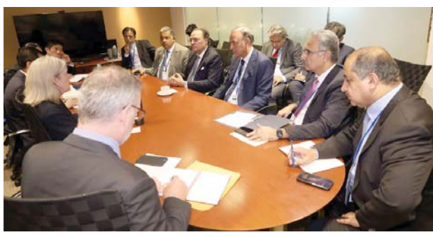
During a meeting with a team of Standard Chartered Bank, Finance Minister Muhammad Aurangzeb appreciated the Bank's longstanding partnership with Pakistan.

Affairs of the UAE Mohamed bin Hadi Al Hussaini and appreciated the UAE's continued support for Pakistan's external account.