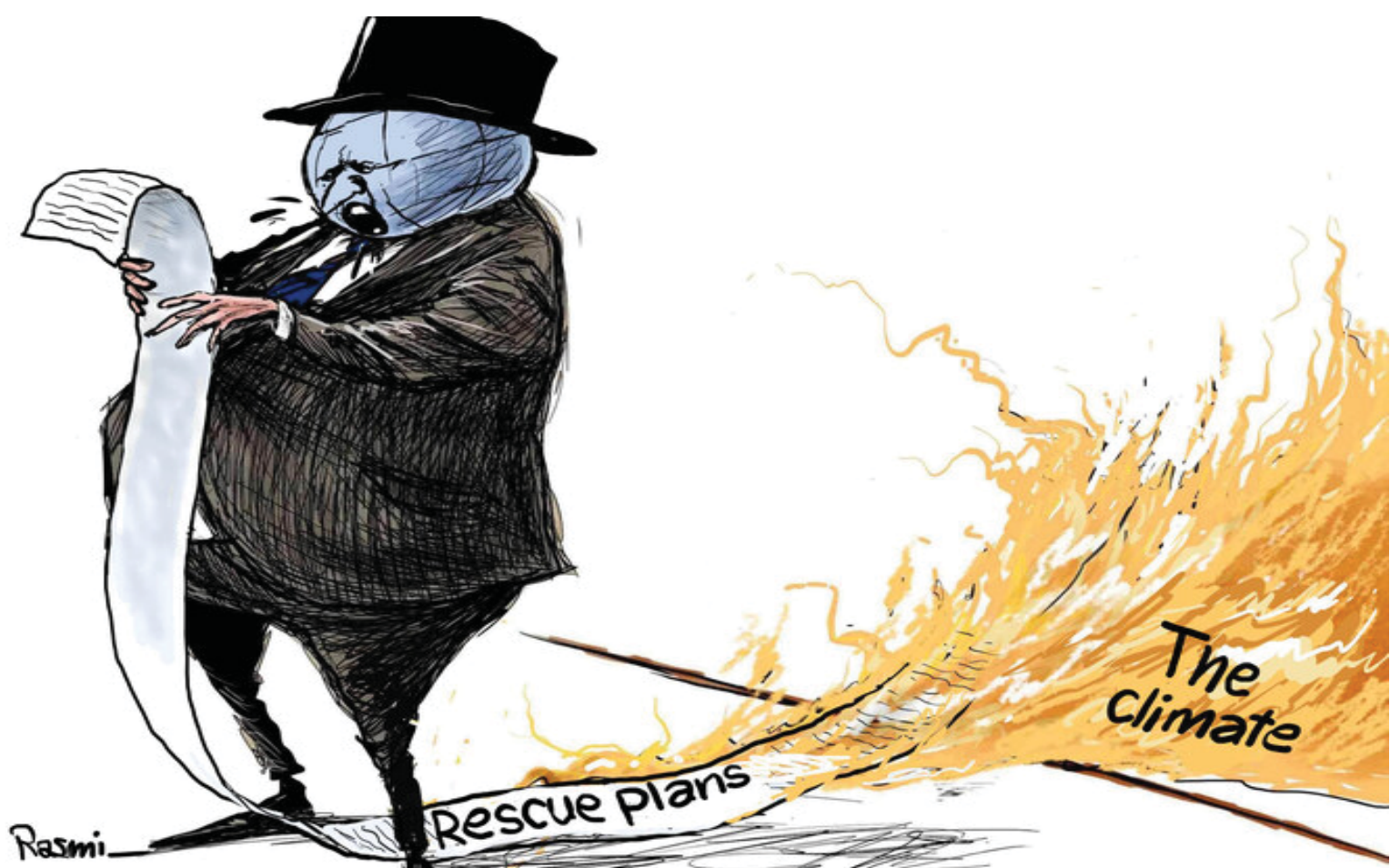
Cartoon by Amjad Rasmi.