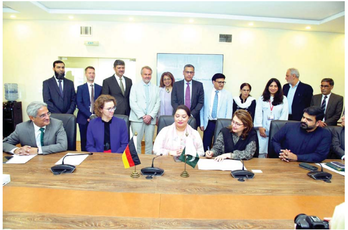
importance of the nitrous oxide emissions initiative, saying the NACAG initiative would be crucial in helping Pakistan meet its carbon mitigation targets by reducing nitrous oxide emissions from the nitric acid sector.