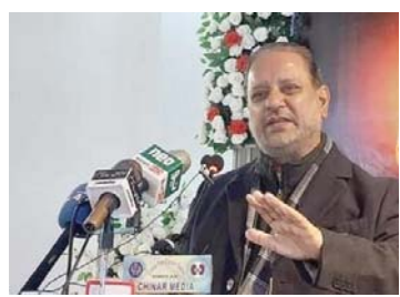
expressed these views in his message on the occasion of the 77th Founda-

ar Muhammad Abdul Qayyum Khan is our first duty. Peace cannot be established in the world without the solution of the Kashmir and Palestine problem. The establishment of non-state parties in Azad Kashmir weakened the position of the government of Pakistan on the Kashmir issue and the process of division of the nation also began in Azad Kashmir. Pakistan has the ability to rise from all difficulties. India has emerged as a terrorist country. He