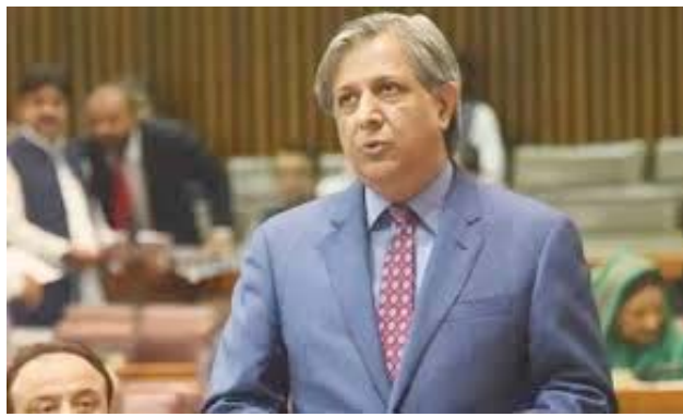
Pakistan Bar Council.

He noted that bar associations across Pakistan criticized this, demanding the restoration of the original spirit of the 18th Amendment, a demand echoed by the Supreme Court and the