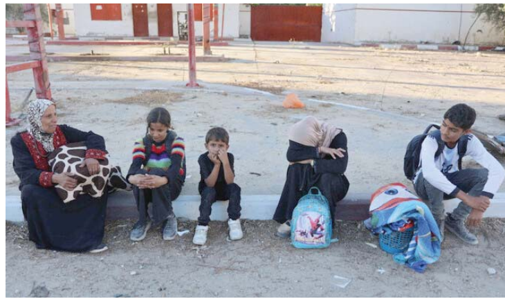
Displaced Palestinians, ordered by the Israeli army to leave the school in Beit Lahiya where they were sheltered, rest as they arrive in Gaza City on October 19, 2024. Gaza's civil defence agency said on October 19, more than 400 Palestinians were killed in the north of the territory over the past two weeks during an ongoing Israeli military assault which has displaced tens of thousands.

"Whoever drops the weapon and hands over the hostages will be allowed to leave and live in peace," read the