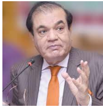
they can do their job. The inflation rate has dropped to less than

Lauding the role of SIFC, he said that Pakistan's global ranking is also improving, and there is a need to attract foreign investment as well as pay attention to local investors so that