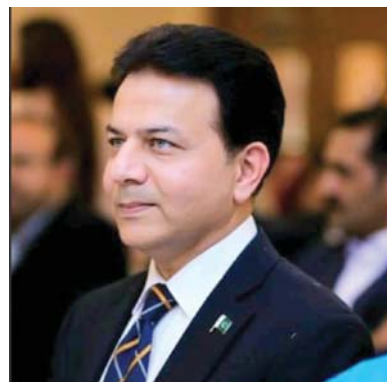
He said that about three years ago when