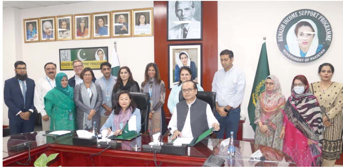
to strengthen this vital partnership with WFP. Our commitment to the Benazir Nashonuma Programme remains unwavering, and we are dedicated to expanding its reach and effectiveness to ensure that every child in Pakistan gets the opportunity of a healthy start in life, setting the foundation for a brighter and more prosperous future".